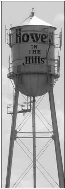
File photo Howey-in-the-Hills is north of Montverde and Minneola.